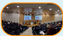
18 - 20 October 2023 1st REGINA-MSP cross-regional workshop (Thessaloniki)

Both workshops were organized by the Aristotle University of Thessaloniki (School of Spatial Planning and Development), with the support of Central Macedonia Region.