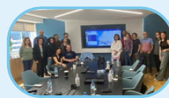
22 - 23 May 2024 2nd local workshop in CMR (Thessaloniki)